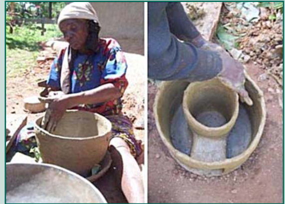
Making a biochar stove in Kenya.

In rural areas, an estimated 3 billion people still cook with biomass fuels such as wood, dung and leaves. The many inefficient stoves in use have resulted in severe respiratory illness and death. Over 1.6 million children die annually in the developing world from the consequences of exposure to biomass fuel (Edelstein et al., 2008). The International Biochar Initiative (IBI) has assisted in several projects that are improving cookstove efficiency while producing biochar for use as a soil amendment. These projects are part of a broad movement to end this serious world health issue. See the Further resources section at the end of this publication for more information about IBI.