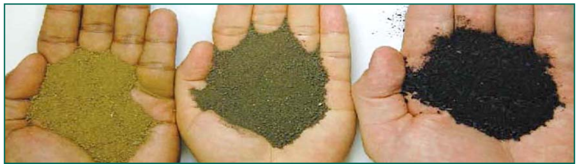
Biochar from various feedstocks. Photo courtesy of Nature.

Biochar has the potential to produce farm-based renewable energy in a climate-friendly manner and provide a valuable soil amendment to enhance crop productivity. If carbon offset markets develop, biochar can provide income for farmers and ranchers who use it to sequester carbon in soil. This publication will review the current research and issues surrounding the production and use of this emerging biomass energy technology and explore how biochar can contribute to sustainable agriculture. Biochar is the product of turning biomass into gas or oil with the intention of adding it to crop and forest production systems as a soil amendment.